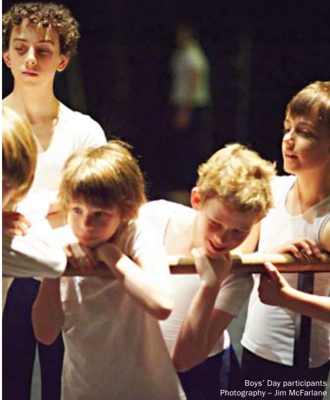
Boys' Day participants

PLEASE NOTE For security purposes and in case of an emergency, the names of all students will be required at the time of booking for all Classes, Workshops and Boys'Days.