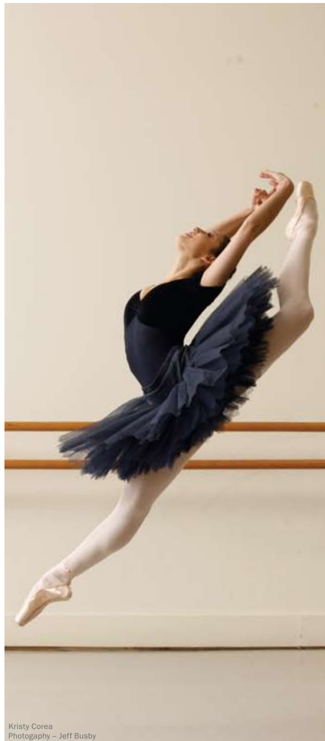
Kristy Corea Photography – Jeff Busby