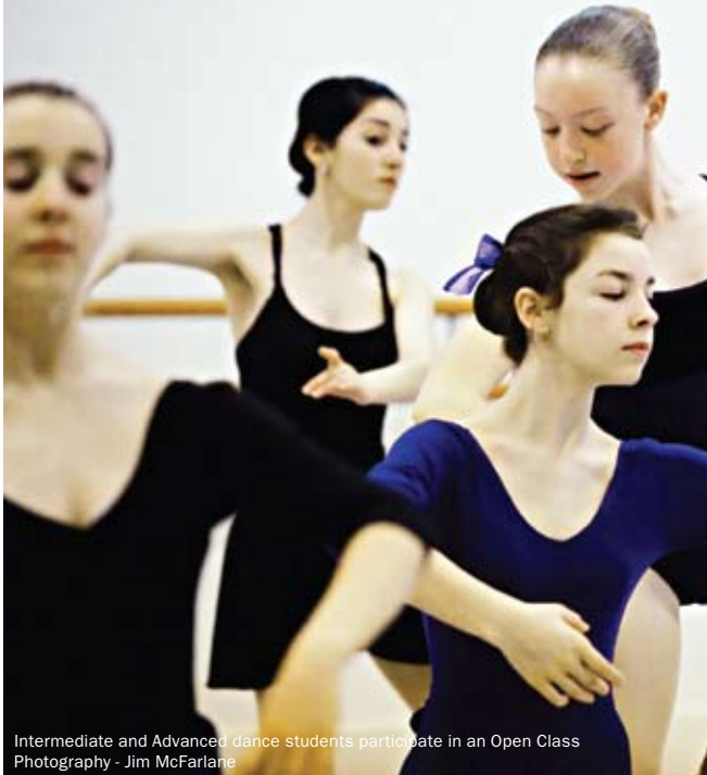
Intermediate and Advanced dance students participate in an Open Class